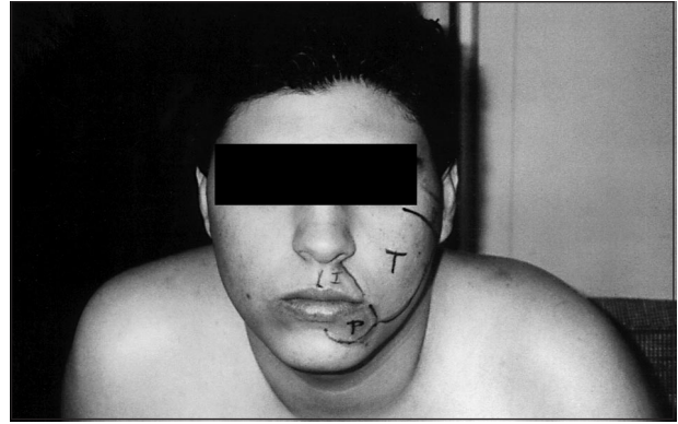
Figure 2. Points on the face of a patient that elicit precisely localized, modality-specific referral in the phantom limb 4 weeks after amputation of the left arm below the elbow. Sensations were felt simultaneously on the face and phantom limb.

Taken collectively, these findings provide strong support for the remapping hypothesis. They may allow us to track the time course of perceptual changes in humans and relate these in a systematic way to anatomy. The occurrence of topography and modality specificity rules out any possibility of the referral being due to non-specific arousal.