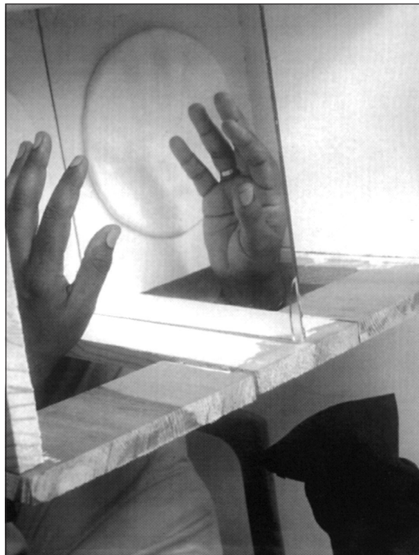
Figure 3. Mirror box used to provide visual feedback. Patient views the reflection of his own hand in the mirror.

Is the remapping that occurs in the adult somatosensory cortex beneficial to the organism? Or is it an “epi-